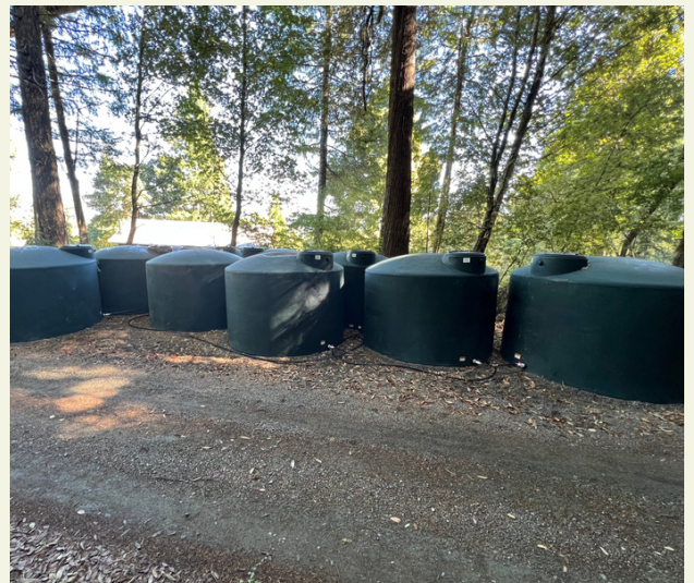
Post-installation site visit for our Drought Resilience Program in October 2023 at Ashram Farms. Eight 5,000 gallon water tanks were installed to provide 100% water storage needs for the farm.

Follow us on social media to stay up-to-date with our conservation efforts!