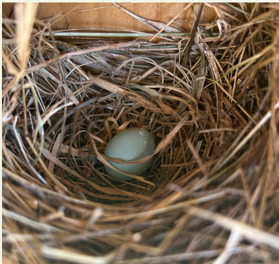
A Western Blue Bird ( Sialia mexicana ) nest in a WCC habitat enhancement at Mattole Valley Sungrown.