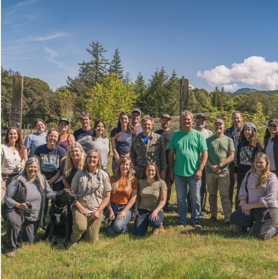
The Wildlife Conscious Certification team, pilot farms, CDFW CRGP staff, and future WCC accreditors at the WCC Farm Visit, May 2023.